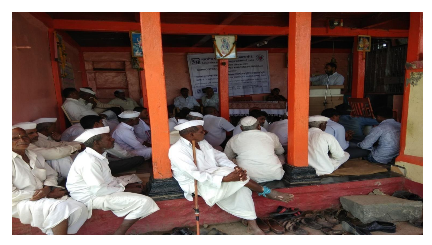
Participants at the program on 27/08/2019 at Andhalgaon