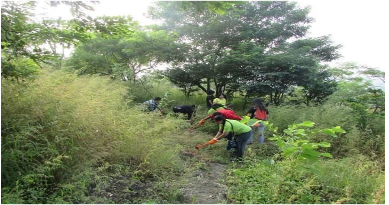
NELDA: - 2