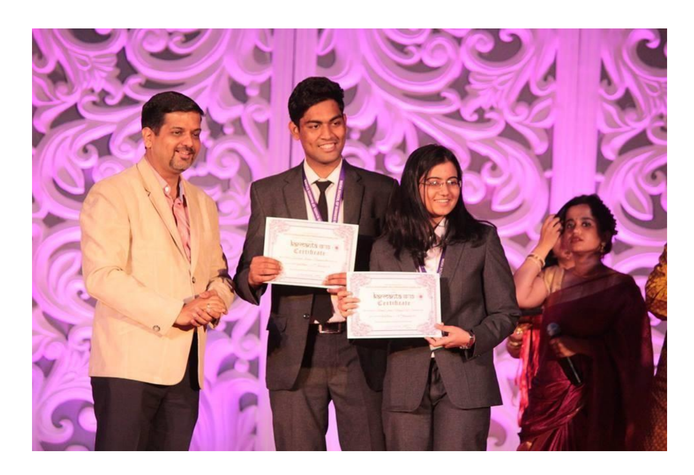
Karmanta 2019 : IMERT and MMCOE MBA Students' Council organized the inter-collegiate extra curricular event Karmanta on January 14,15 & 16, 2019. Indira School of Business Studies, Tathawade won the Trophy.