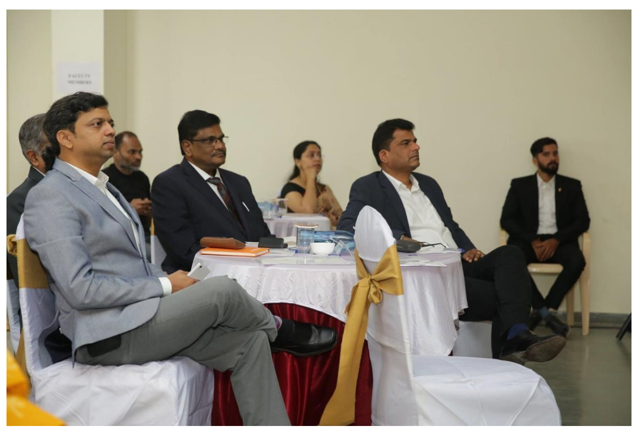
'5th Edition of HR Conclave – 2018' was organized by Corporate Relations Division of Marathawada Mitramandal (Institute of Management Education Research & Training IMERT and MMCOE MBA) with the theme as "Redefine & Grow".

Panel 1 Topic: 'People Strategies in VUCA World'