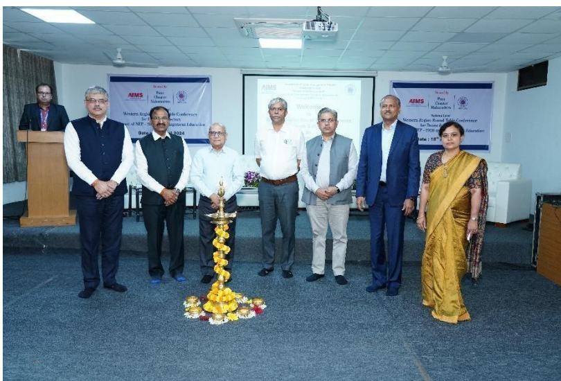
Photo Caption : Dignitaries Present at AIMS Western Region Roundtable Conference for Deans and Directors and

Western Region Roundtable Conference for Deans and Directors was organized by Pune Chapter of Association of Indian Management Schools (AIMS) in association with Marathwada Mitra Mandal's Institute of Management Education Research and Training, (IMERT). The theme of the conference was "Potential Impact of NEP 2020 on Management Education."