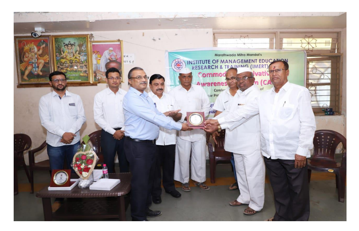
Felicitation of the Sarpanch of Bhagawatipur