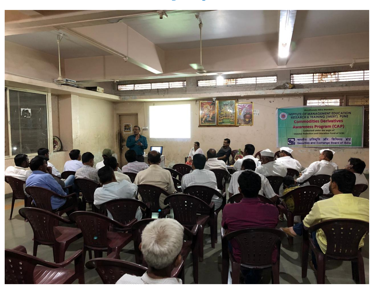
First program on 16/03/2019 from 06.00 pm to 08.30 pm at Kolhar, Bhagawatipur

Program got media coverage through a local newspaper also.