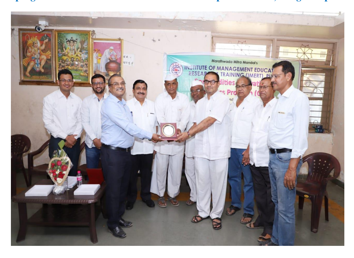
Felicitation of the Sarpanch of Kolhar