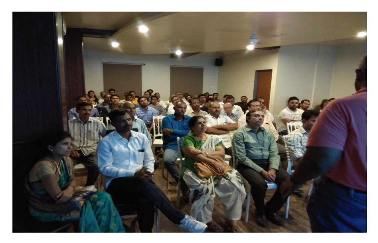
Participants at the program on 08/06/2019 at Satara